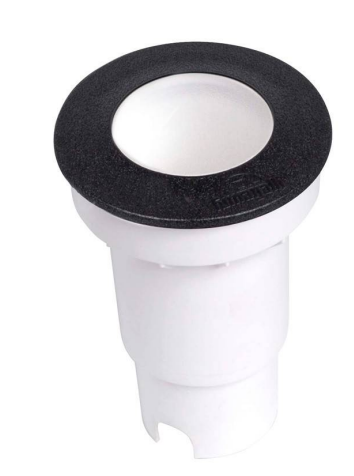
CCT FUMAGALLI CECI 90 GU10 3.5W recessed LED ground beacon CCT FUMAGALLI C ECI 90 GU10 3.5W