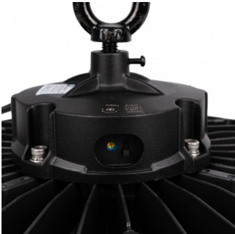
Industrial LED High Bay - LIFUD Driver - 200W - 160lm/W - PHILIPS Chip - Dimmable 1-10V - IP65

High power and high luminous efficacy industrial LED light fixture. Its compact and lightweight design allows easy and quick installation. It incorporates Philips Lumileds LED chips with maximum efficacy: 160 lm/W, offering powerful lighting in two options: neutral white (4000K) or cool white (5000K). It has a Lifud driver dimmable to 1-10V.