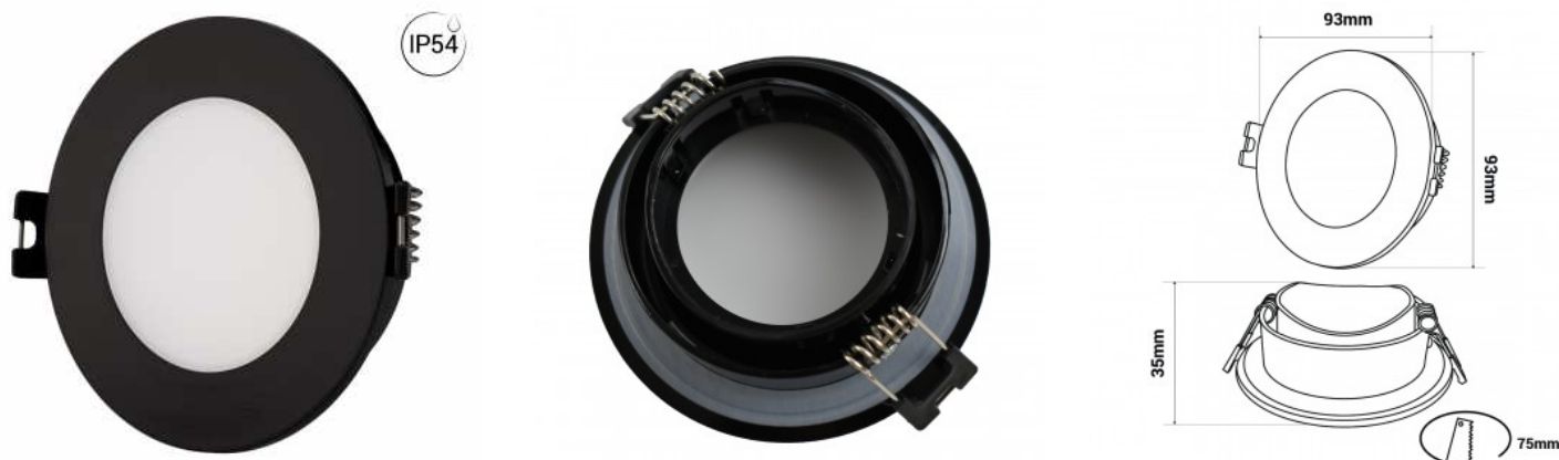
Circular waterproof downlight ring for GU10 / MR16 bulb - Opal diffuser - Cut Ø 75-80 mm - IP54