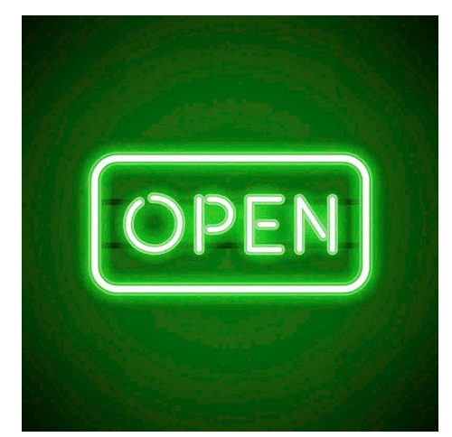
Flexible LED neon RGB 24V DC - 13X6mm - 5 meters - Complete kit - 11W/m - I P67 - Lateral curvature