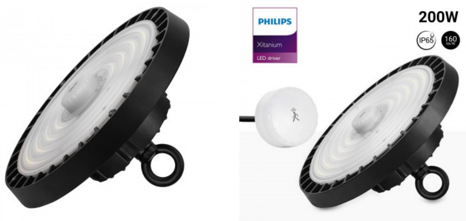
Industrial LED High Bay light with motion sensor - 200W - Philips driver - Dimmable 1-10V - IP65