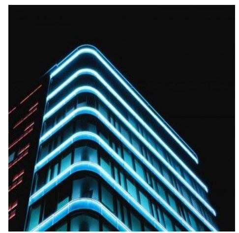
Flexible LED neon 24V DC - 12x12mm - 10 meters - Complete kit - 11W/m - IP67 - Vert ical curvature