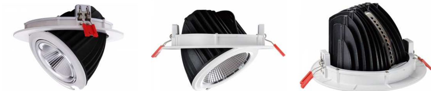
48W COB LED Downlight - CRI80 - Philips chip - Lifud driver - IP20 - Cutout Ø 215mm