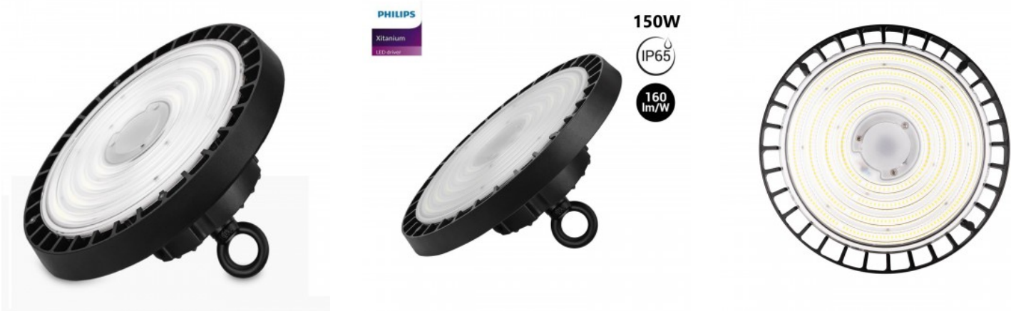
Industrial LED High Bay - PHILIPS Driver - 150W - 160lm/W - PHILIPS Chip - Dimmable 1-10V - IP65

High power and high luminous efficacy industrial LED light fixture. Its compact and lightweight design allows easy and quick installation. It incorporates Philips Lumileds LED chips with maximum efficacy: 160 lm/W, offering powerful illumination in 3 options: warm white (3000K), neutral white (4000K) or cool white (5000K). It has a Philips driver dimmable to 1-10V.